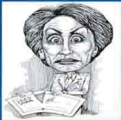
Cruella DeVile and Scooby Doo